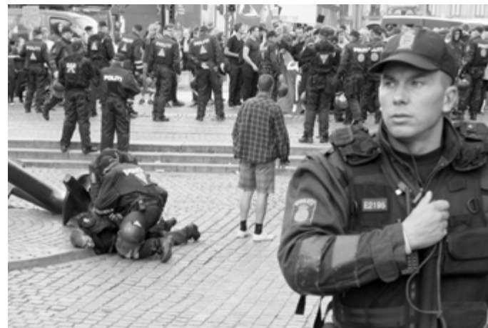
City life 3. Copenhagen, Denmark. 2016