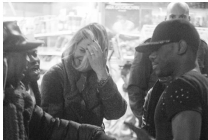
City life 55. Paris, France. 2015