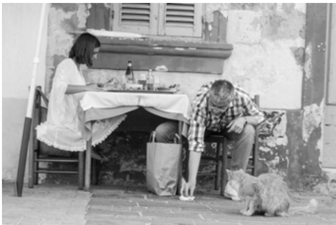
City life 52. Malta. 2015