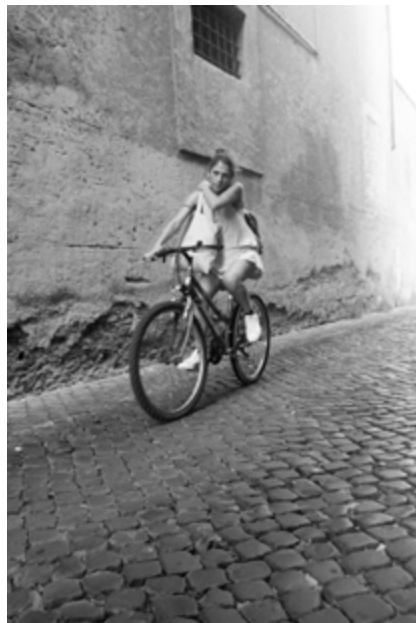
<-- Helsinki 1. Finland. 2017