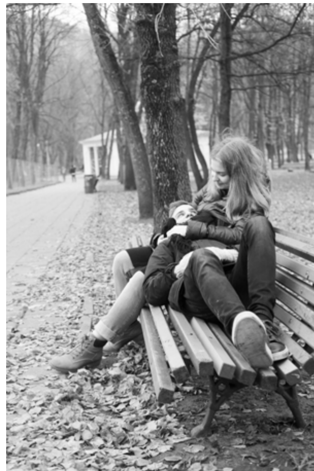
City life in Vilnius 18. Lithuania. 2018