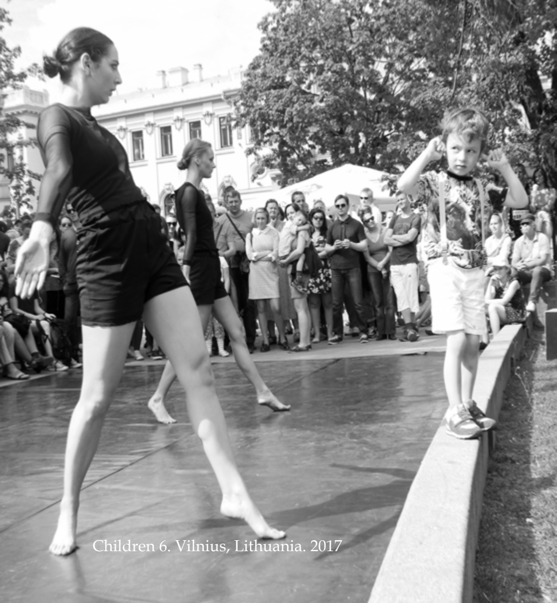
Children 6. Vilnius, Lithuania. 2017