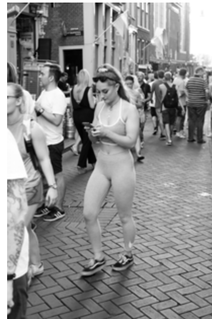
<-- City life 10. Paris, France. 2014 --> Gay Pride 6. Amsterdam, Holland. 2018