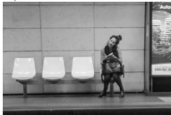
City life 38. Lion, France. 2014