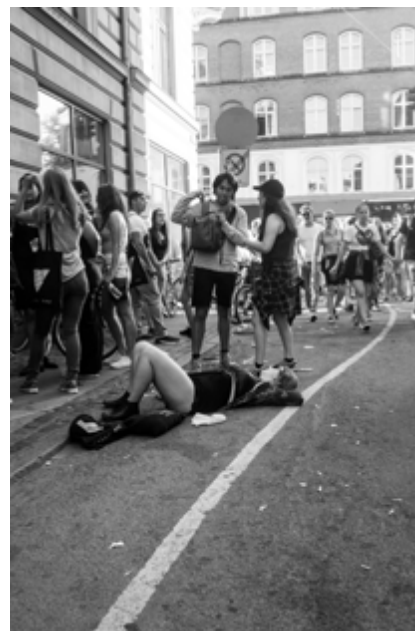
<-- Distortion 58. Copenhagen, Denmark. 2016