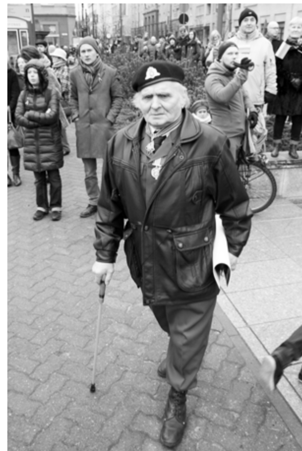
National celebration 7. Kovo 11. Vilnius, Lithuania. 2017