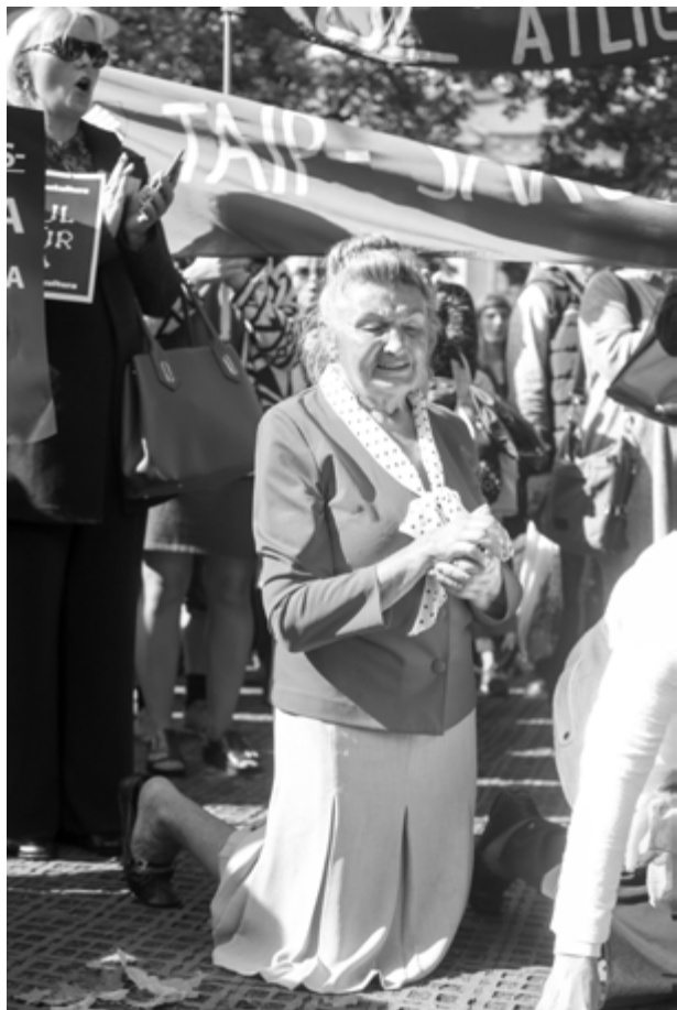
152 Teachers protest. Vilnius, Lithuania. 2018