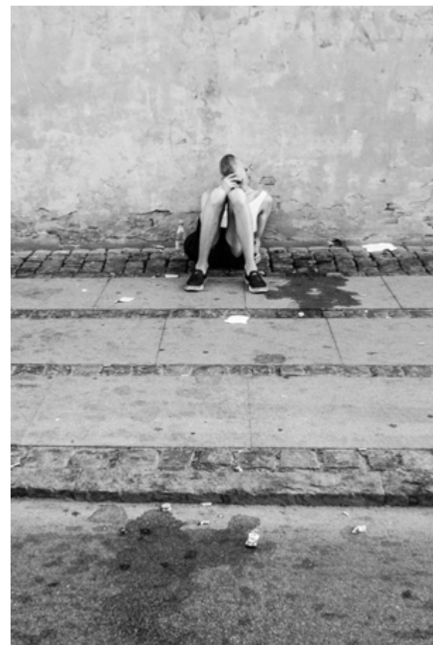
Distortion 71. Copenhagen, Denmark. 2016

"Distortion" is an annual street music festival occurring in Copenhagen