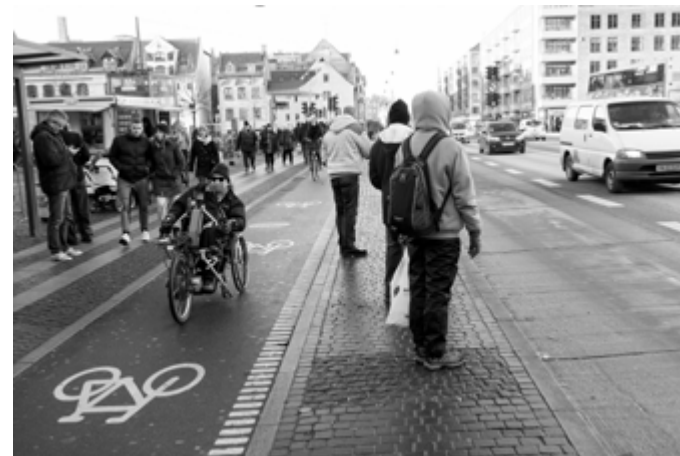
City life 17. Copenhagen, Denmark. 2017