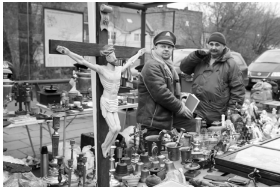
Kaziuko mugė 1. Vilnius, Lithuania. 2017