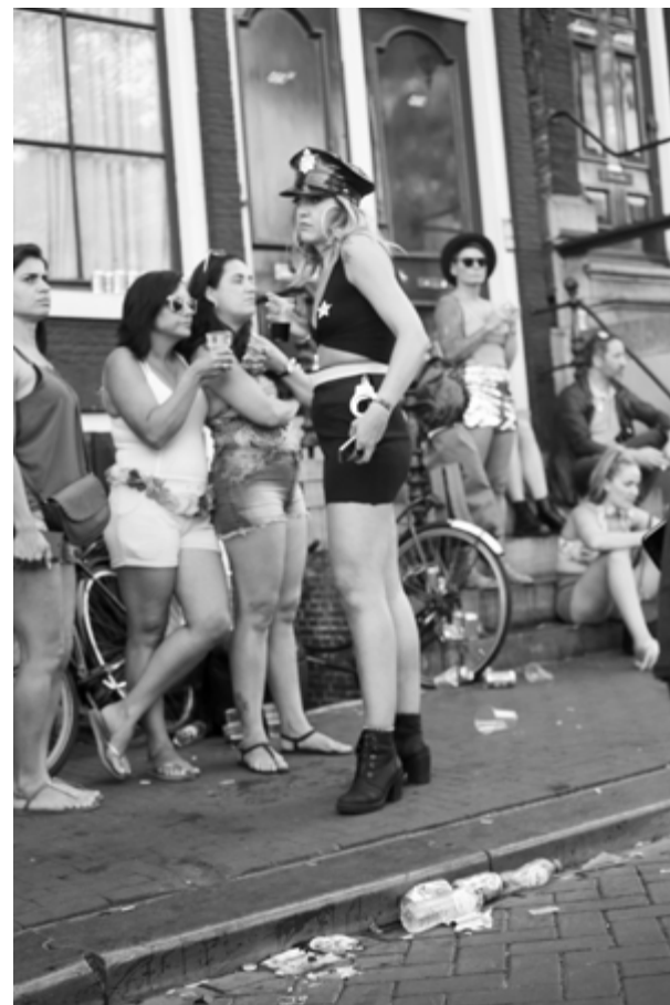
Gay Pride 26. Amsterdam, Holland. 2018