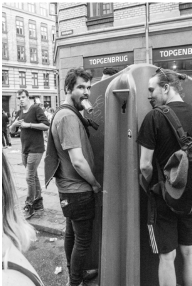
108 Distortion 110. Copenhagen, Denmark. 2016