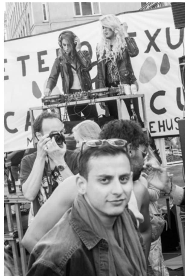
Distortion 41. Copenhagen, Denmark. 2015