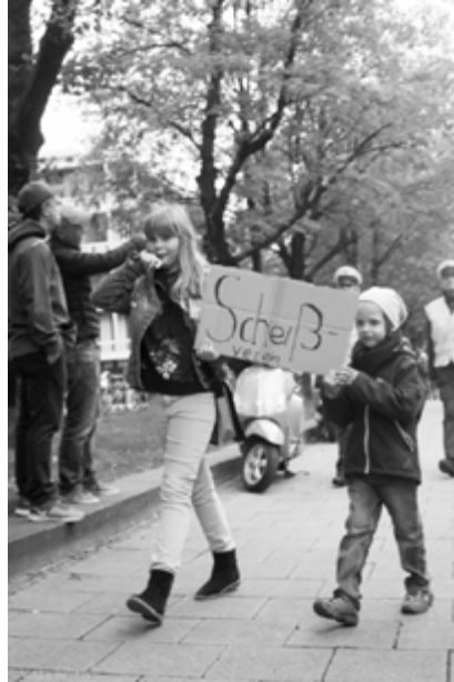
<-- Antifa protest 1. Munich, Germany. 2018