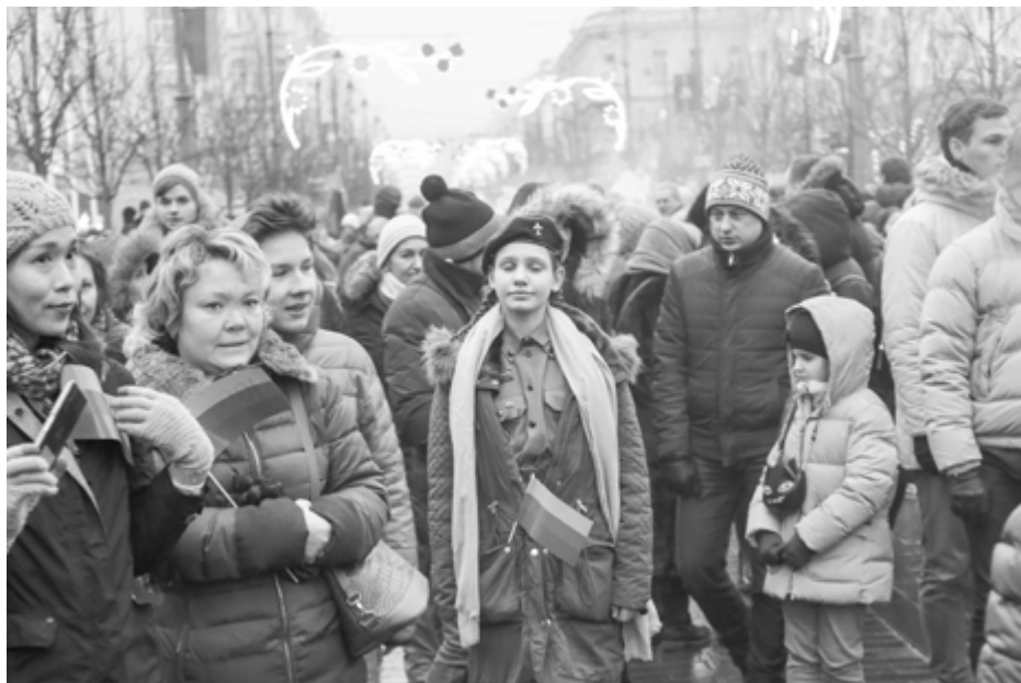
48 National celebration 28. Vasario 16. Vilnius, Lithuania. 2018