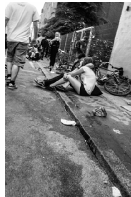
--> Distortion 74. Copenhagen, Denmark. 2016