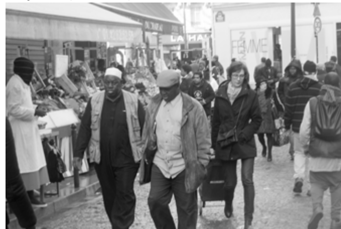
City life 41. Paris, France. 2015