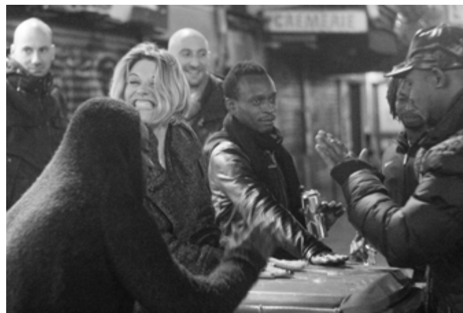
City life 57. Paris, France. 2015