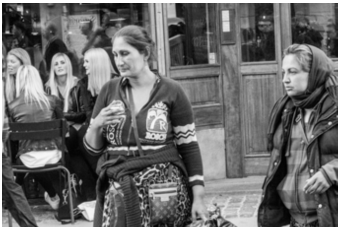
Distortion 42. Copenhagen, Denmark. 2015