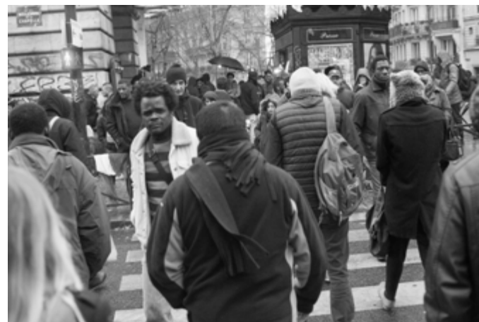
City life (untitled). Paris, France. 2016