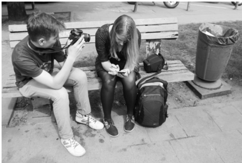
116 Young photographer with a girl. Vilnius, Lithuania. 2017