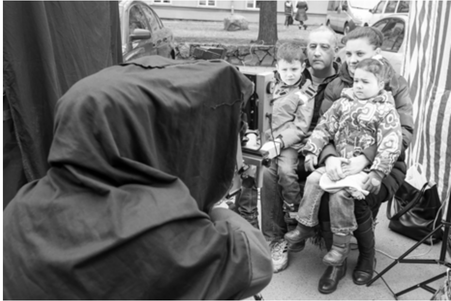
174 Kaziuko mugė 6. Vilnius, Lithuania. 2017