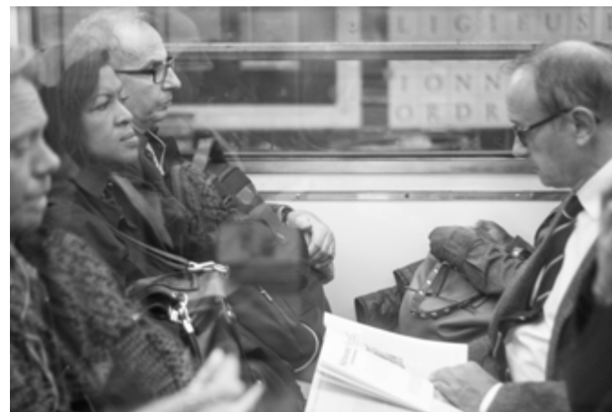
City life 20. Paris, France. 2014