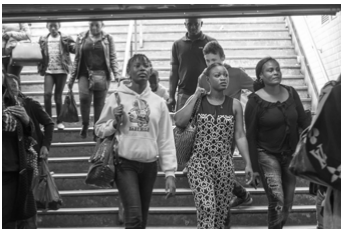
City life 1. Paris, France. 2014