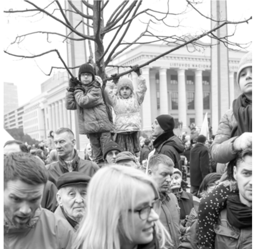
National celebration 13. Kovo 11. Vilnius, Lithuania. 2017 175