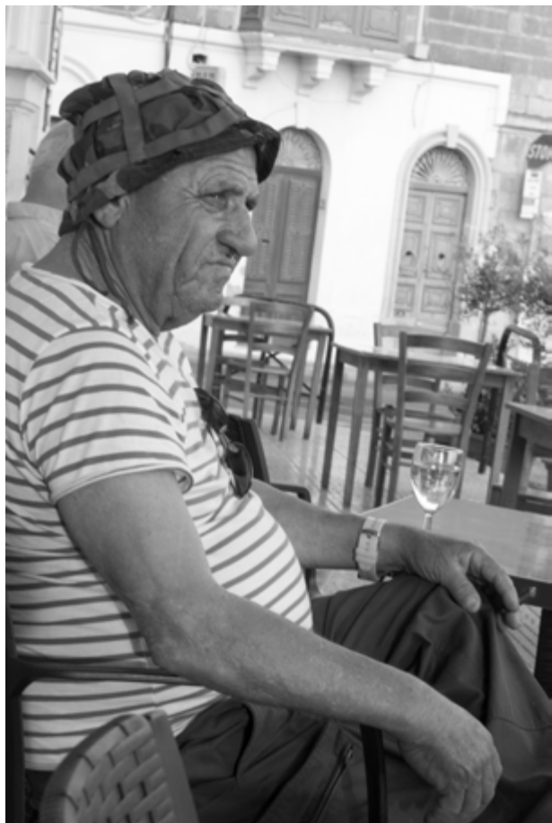
City life 67. Malta. 2015