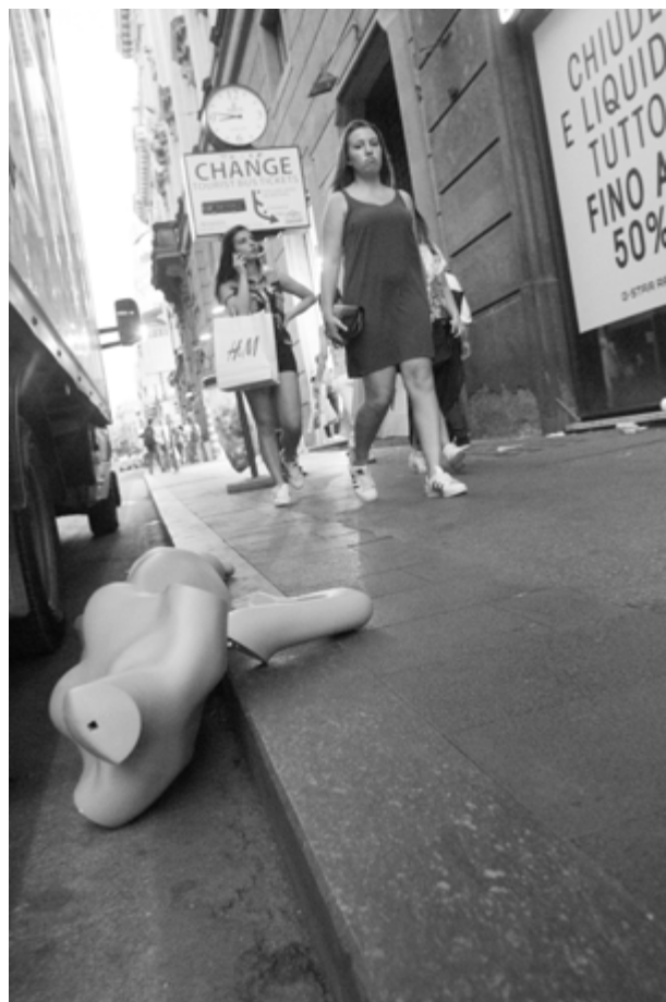
City life 59. Rome, Italy. 2016