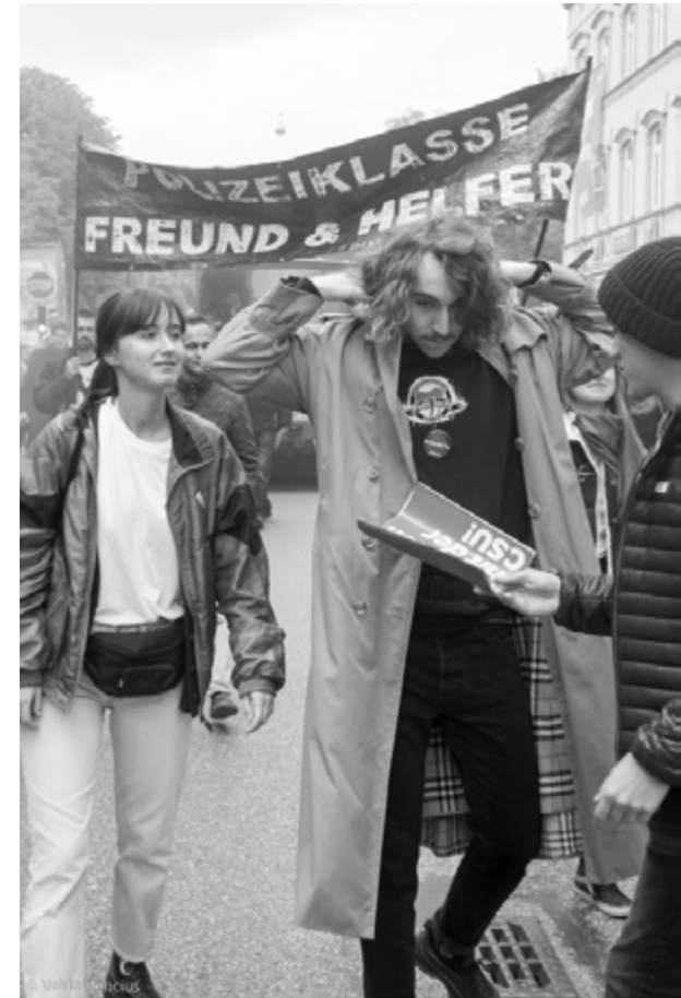
Antifa protest 15. Munich, Germany. 2018