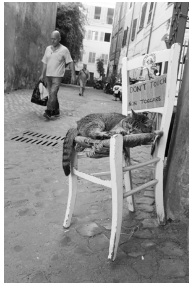
City life 30. Rome, Italy. 2016