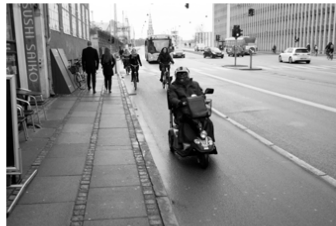
City life 19. Copenhagen, Denmark. 2017