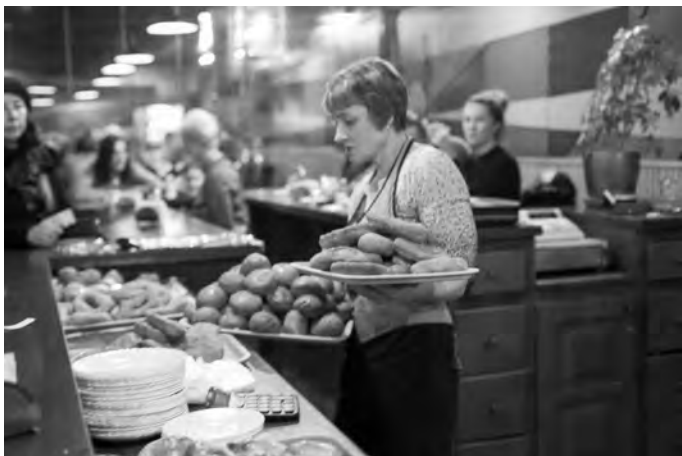
Spurginė 6. Kaunas, Lithuania. 2018