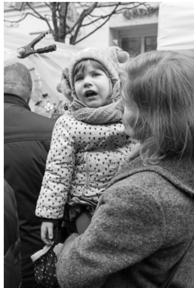
Children 5. Vilnius, Lithuania. 2017