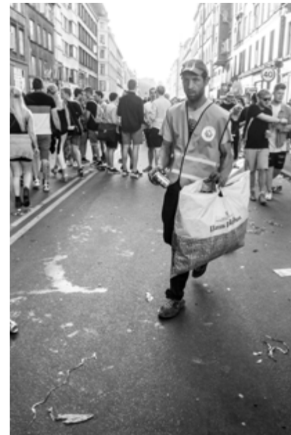
<-- Distortion 21. Copenhagen, Denmark. 2015 --> Distortion 54. Copenhagen, Denmark. 2016