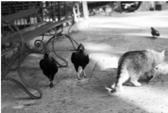
130 City life 92. Malta. 2018