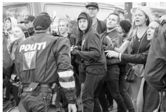
City life (untitled). Copenhagen, Denmark. 2016