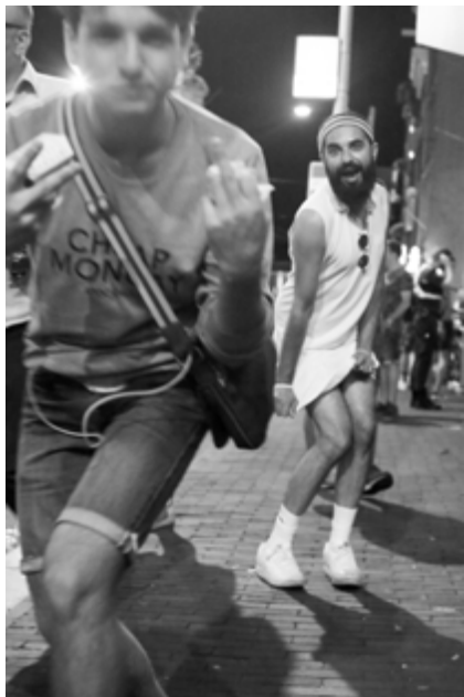
<-- Gay Pride 5. Amsterdam, Holland. 2018 --> Gay Pride 2. Amsterdam, Holland. 2018